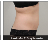
6 weeks after 2 nd SculpSure series