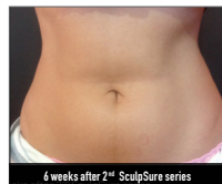
6 weeks after 2 nd SculpSure series